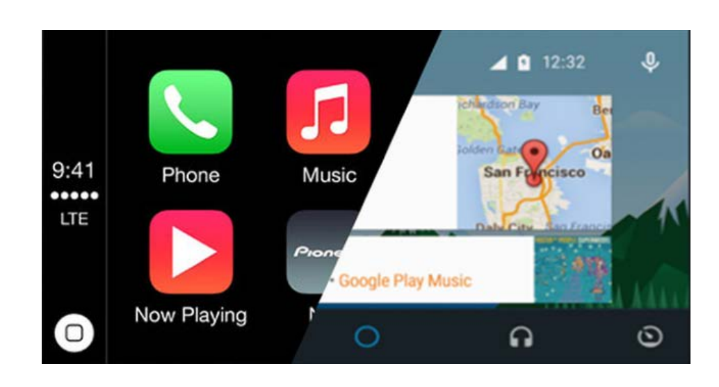
CarPlay Integration for Mercedes-Benz NTG 5.0/5.1