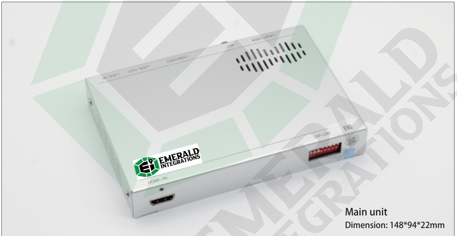
Main unit Dimension: 148*94*22mm